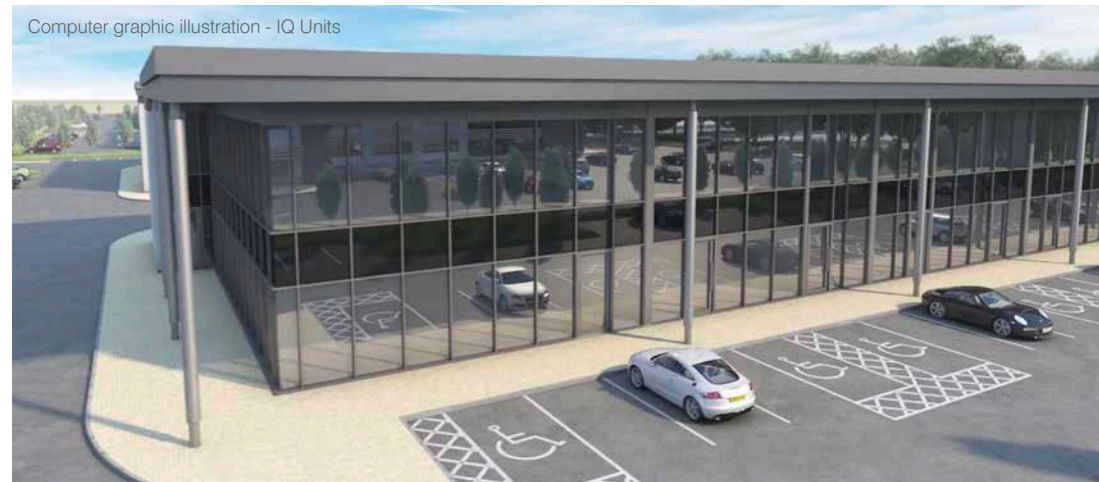
Computer graphic illustration - IQ Units