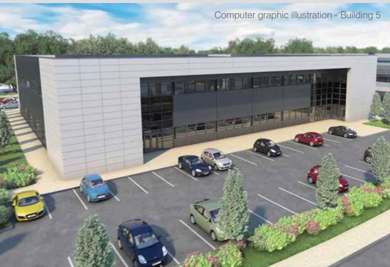
Computer graphic illustration - Building 5

The Innovation Quarter forms the third phase of development on the Park, following on from the completion of a 49,000 sq.ft. HQ facility for Native Antigen, the 34,125 sq.ft. landmark, lab-enabled office Building One and a 101 bedroom hotel and restaurant.